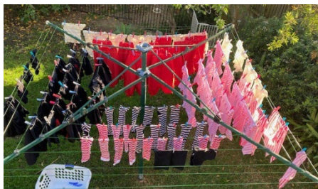
Mrs Tromp's washing line post-show!