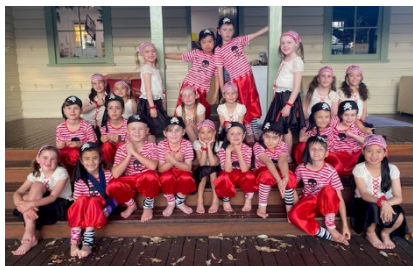
2T ready in their costumes

It was my absolute pleasure and privilege to be able to oversee, watch and enjoy over 12 rehearsals or performances. I got to see the all the wonderful moments when students made eye contact with loved ones. The smiles on faces and pride in eyes is priceless, especially with grandparents during the matinees. To perform on stage in front of an audience can be daunting for some and exhilarating for others. Careful consideration is taken by each class teacher for every student with many adjustments being made to ensure that all can succeed. Whilst we have our specialist dance teachers, it is every class teacher that ensures the show is a success. They attend the weekly dance lessons; select music; choreograph routines, source and make costumes and props; supervise students after school hours as well as continuing the core business of teaching. This year the staff have also managed nose bleeds, teeth falling out, emergency toilet breaks, stubbed toes and of course the abnormally hot weather.